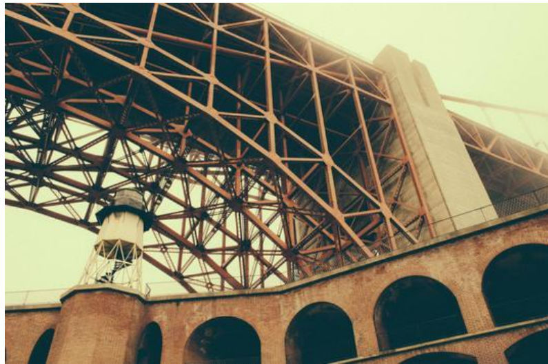
Figure 2.1: Another figure example

Lorem ipsum dolor sit amet, consectetur adipiscing elit, sed do eiusmod tempor incididunt ut labore et dolore magna aliqua. Ut enim ad minim veniam, quis nostrud exercitation ullamco laboris nisi ut aliquip ex ea commodo consequat. Duis aute irure dolor in reprehenderit in voluptate velit esse cillum dolore eu fugiat nulla pariatur. Excepteur sint occaecat cupidatat non proident, sunt in culpa qui officia deserunt mollit anim id est laborum [3].