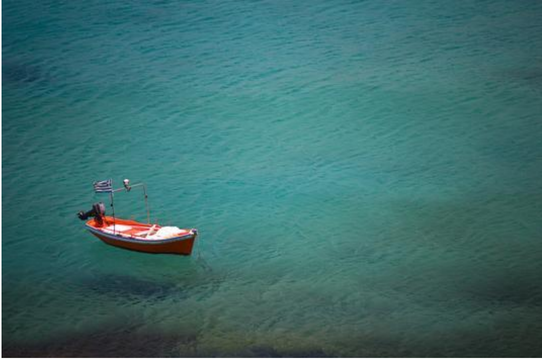
Figure 1.1: Figure example

dolor in reprehenderit in voluptate velit esse cillum dolore eu fugiat nulla pariatur. Excepteur sint occaecat cupidatat non proident, sunt in culpa qui officia deserunt mollit anim id est laborum [2].