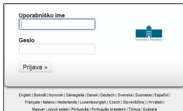
Figure 2: Login form