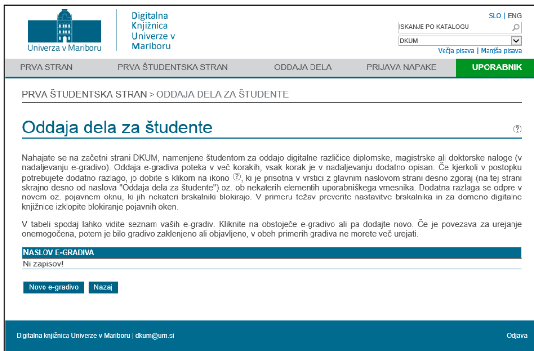
Figure 4: Introductory site for final thesis submission