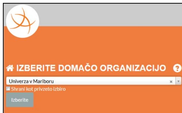
Figure 1: Identity provider selection