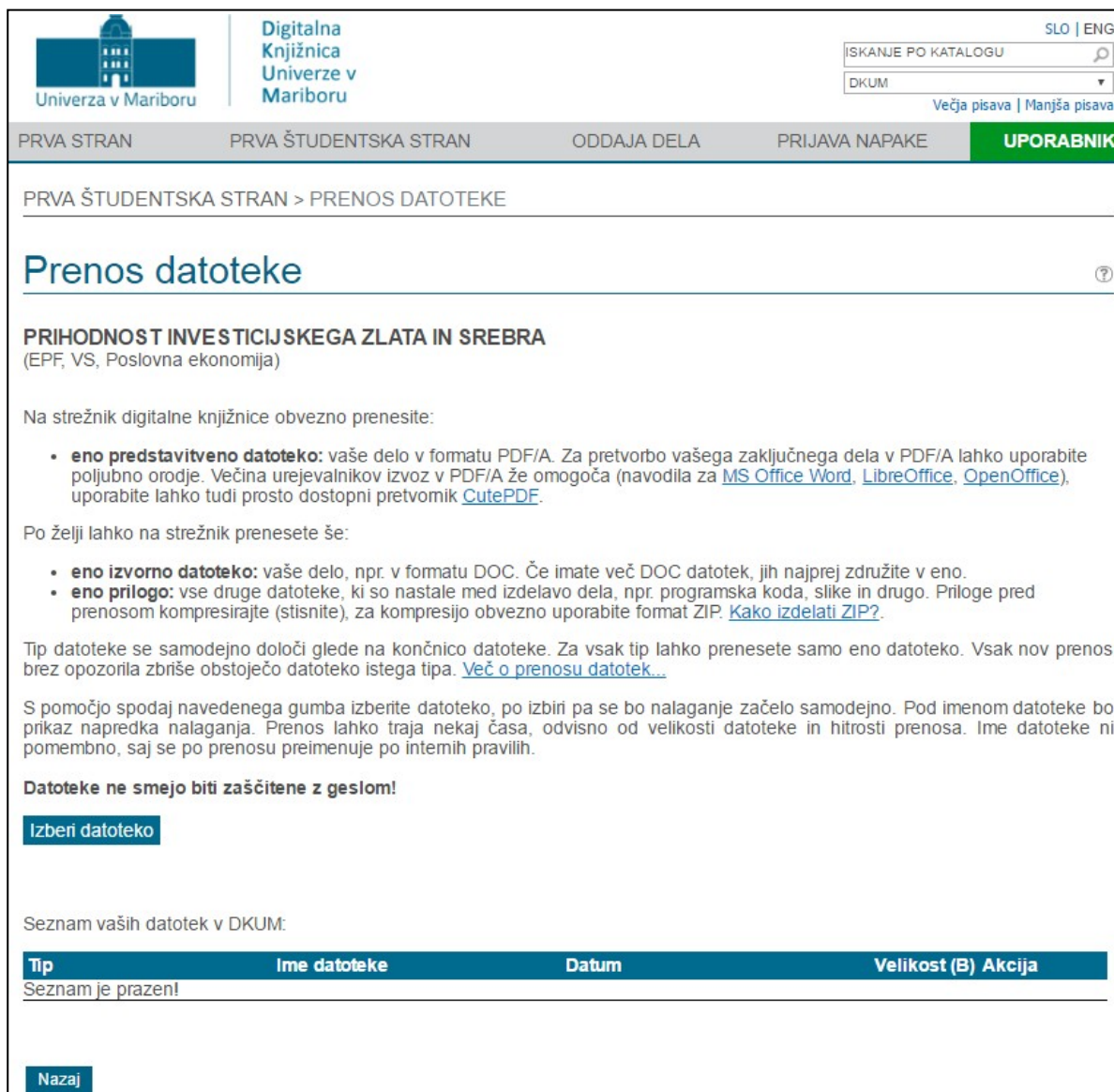
Figure 8: File transmission